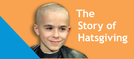
The Story of Hatsgiving

Bring new winter hats, sizes newborn to adult, to any Hatsgiving collection site. Hats may be store-bought or handmade. Visit our website or contact your local Hatsgiving representative for details and locations.